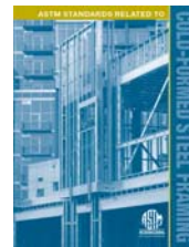
Compilation of ASTM Standards related to Cold-Formed Steel

Three methods of repair are given, but the zinc-rich paint option is most commonly used for steel framing. Note: ASTM C1007 calls out the Military Specification MIL-P-21035 (Paint, High Zinc Dust Content, Galvanizing Repair), whereas ASTM A780 does not specify a minimum requirement for the paint.